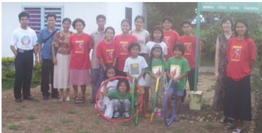
Awana leadership team from Bible Baptist Church in Naga City, Camarines Sur.

A couple of weeks ago, we had a chance to visit a church about two