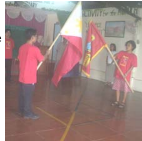
Opening ceremony at Bible Baptist Church.

We are hoping to start our AWANA with the opening of the new school year here, which is